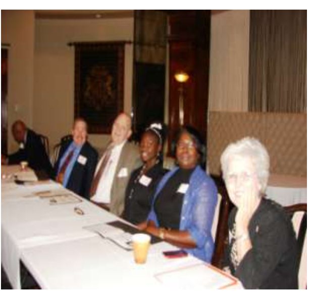
Thank You to Our 2011 Annual Award Sponsors