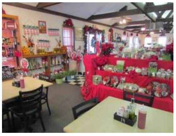
TARC-Terrebonne's Restaurant and Gift Shop