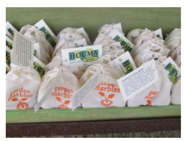
TARC-Terrebonne's Houma Grown Garden Marbles